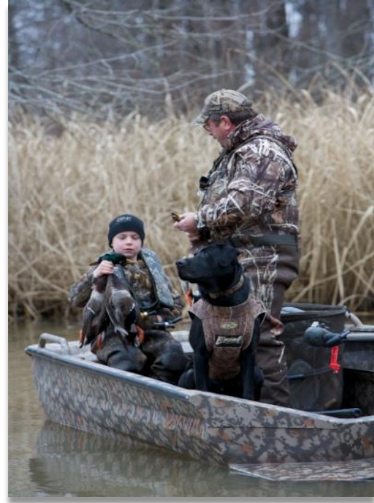
Natural Gear Green - Max-4 - Natural Gear Brown